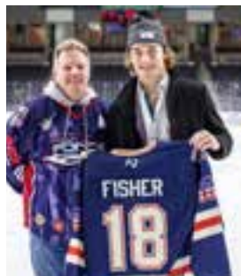
The highest bidder on each Fargo Force hockey player's jersey keeps it at Honor Flight Night

February 8 — All-day Giving Hearts Day, gathering held at the American Legion Post 21 in Moorhead, MN