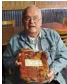
A lucky winner at our meat raffle

April 28 — 11:00am Potato Dumpling Feed and Norwegian Bake Sale at American Legion Post 21 in Moorhead, MN