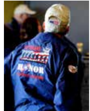
Veterans receive a beautiful coat free of charge, gifted by American Crystal Sugar

Please join us in thanking American Crystal Sugar for the dedication they have shown our Veterans for so many years. We are all blessed to be cloaked in your kindness.