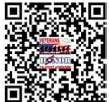
Scan our QR code to visit our unique donation page for Giving Hearts Day or find us online at https://app.givingheartsday.org/#/charity/963