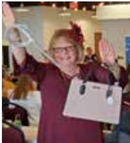
Twice yearly our Purse Bingo events are a fan-favorite

Every Monday (no holidays) in 2024 — 5:30pm Meat Raffle at Speck's Bar in Fargo, ND