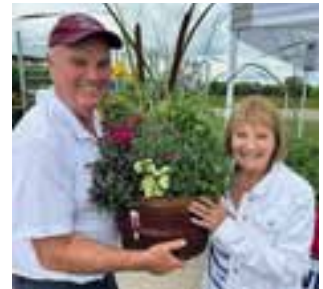
Beautiful floral arrangements at the fundraisers in Alexandria

May 4 — 4:00pm Dinner and live music at VFW Post 5252 in Pelican Rapids, MN