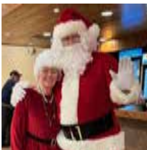
Santa and Mrs. Claus make an appearance at the Hankinson Holiday Bingo event

In December 2023, the Veterans Honor Flight of ND/MN volunteers once again descended on the scene in Hankinson, ND to host Holiday Bingo.